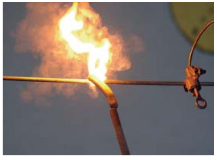
A hot dog gets "burned" by coming in contact with one of the electric power lines. That's 7,200 volts of electricy!

Teaching electrical safety to the kids is a delicate but important job. The crew from Clark Electric that provides this valuable educational experience makes it fun and memorable so the kids take home what they learn that day and remember the dangers of